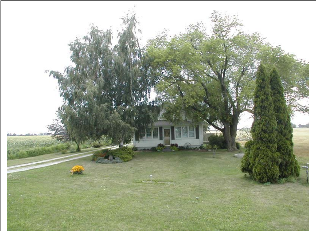
Looking northwest at the existing dwelling on the currently undersized receiving lot