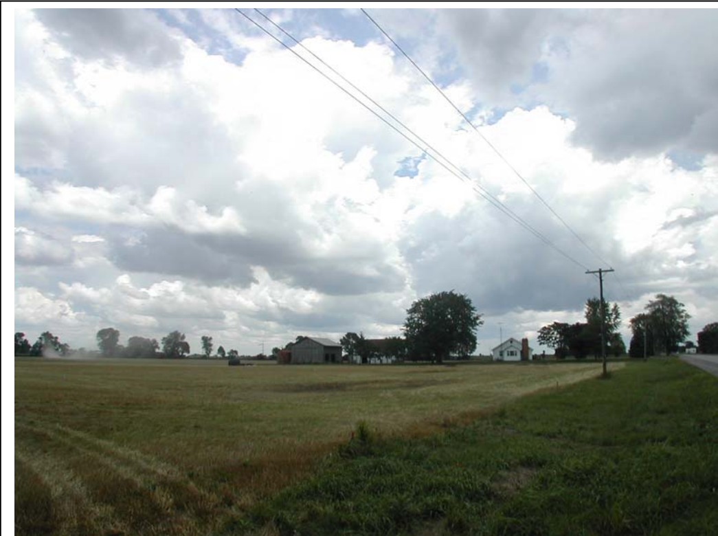
Looking north across the retained farmland and abutting rural residential property