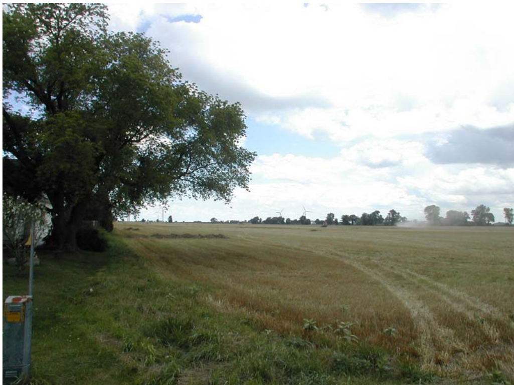
Looking northwest across the lot addition lands (severed parcel)