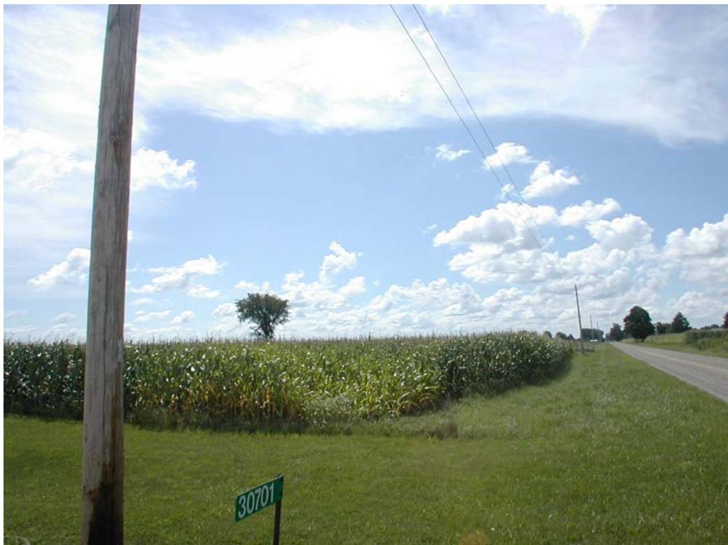
Looking south at the retained farmland