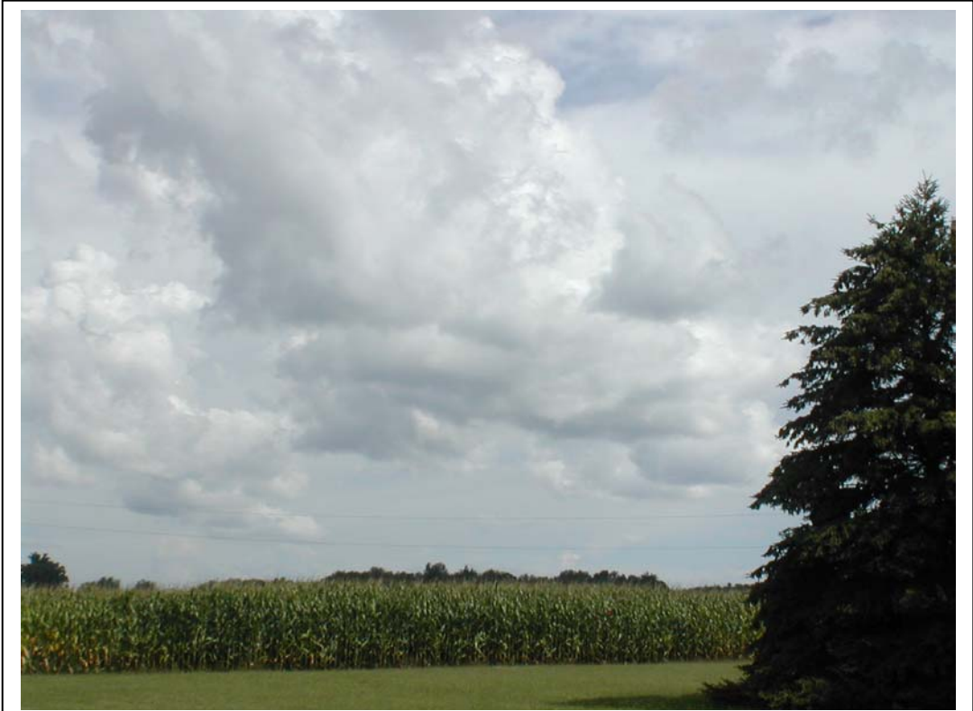
Looking north at the retained farmland