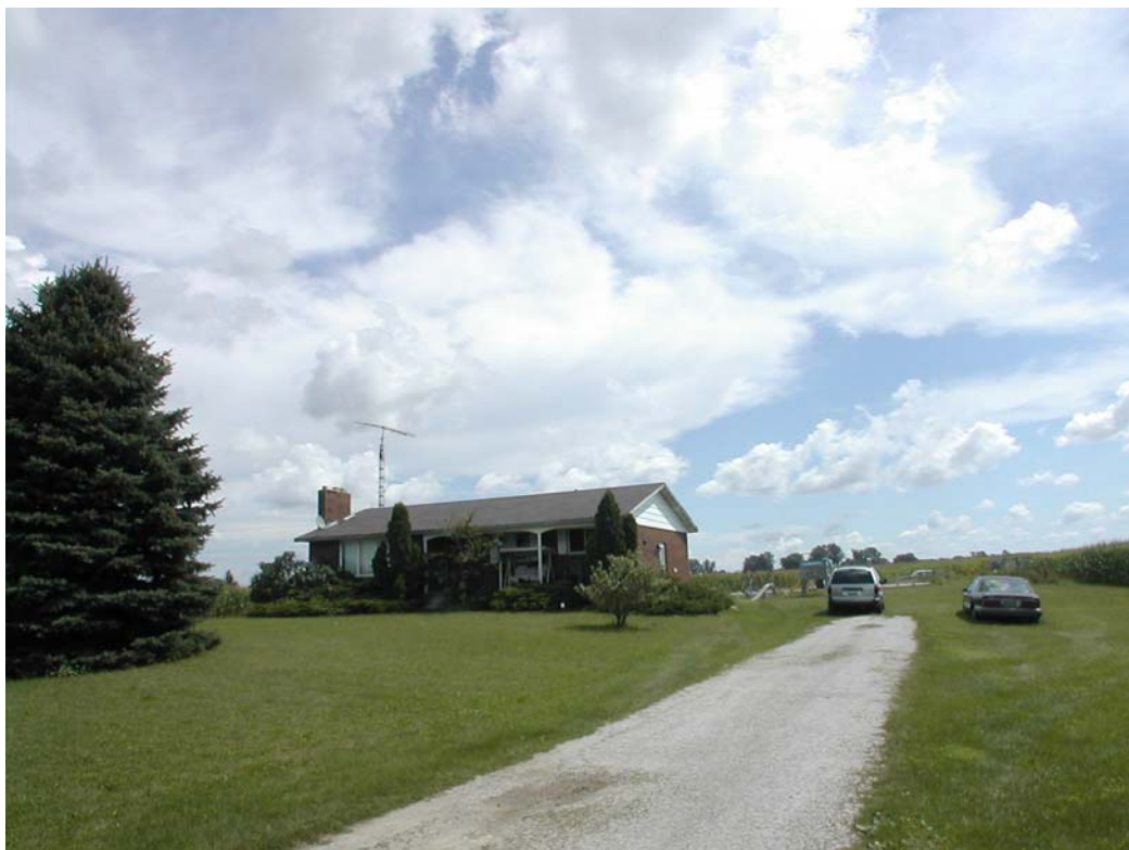
Looking east at the parcel to be severed